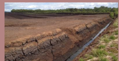
Bolton Fell Moss (T Crockett, NE)

45% of what remains within England lies within Cumbria. Despite a lot of this being protected at a European level, much of it needs restoration to bring it back to its natural state.