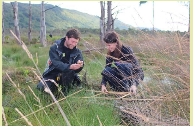
Baseline vegetation survey (T Crockett, NE)