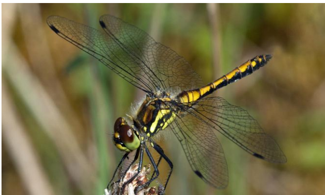
Black Darter (R Petley-Jones, NE)