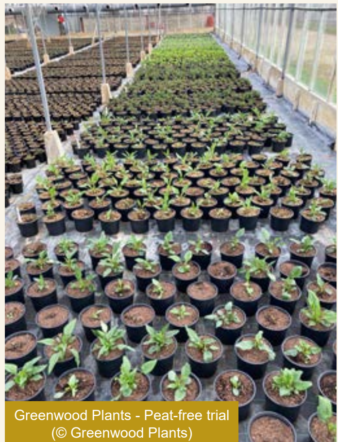
Greenwood Plants - Peat-free trial

Greenwood will continue its peat-free trials into 2023, scaling the size of the trials to increasingly significant numbers, to ensure it is fully ready to support its annual production of more than six million plants in peat-free growing media from 2023.