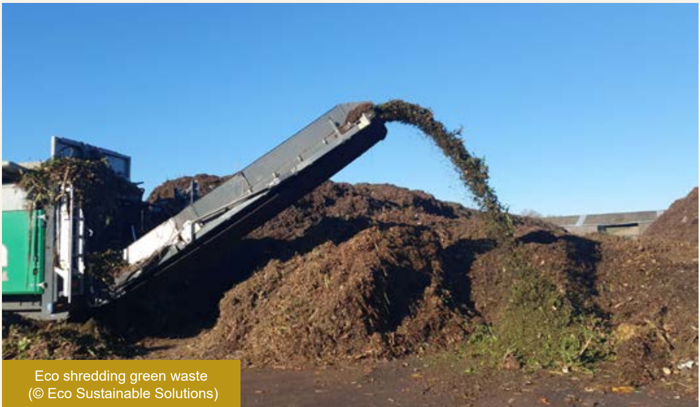
Eco shredding green waste