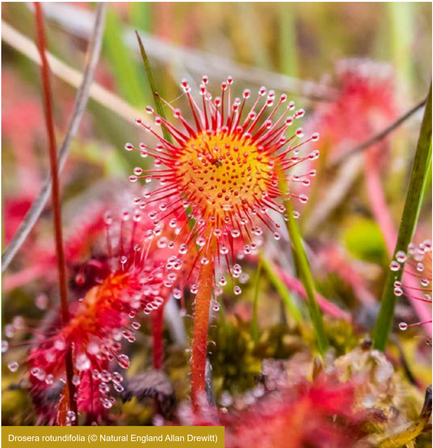
Drosera rotundifolia

The Northern Ireland Peatland Strategy 2021-2040 drafted by the Department of Agriculture, Environment and Rural Affairs includes proposals to ban the use, import and sale of peat compost in Northern Ireland by 2025. All four of the UK devolved administrations have stated plans to work together to form a coordinated approach to ending peat use in the UK.