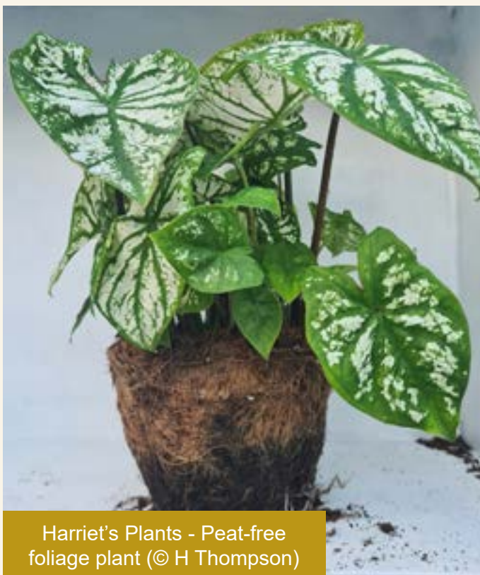
Harriet's Plants - Peat-free foliage plant

The houseplant growing industry in the UK has declined with only a few producers left and the majority of plants are imported from the Netherlands and further afield.