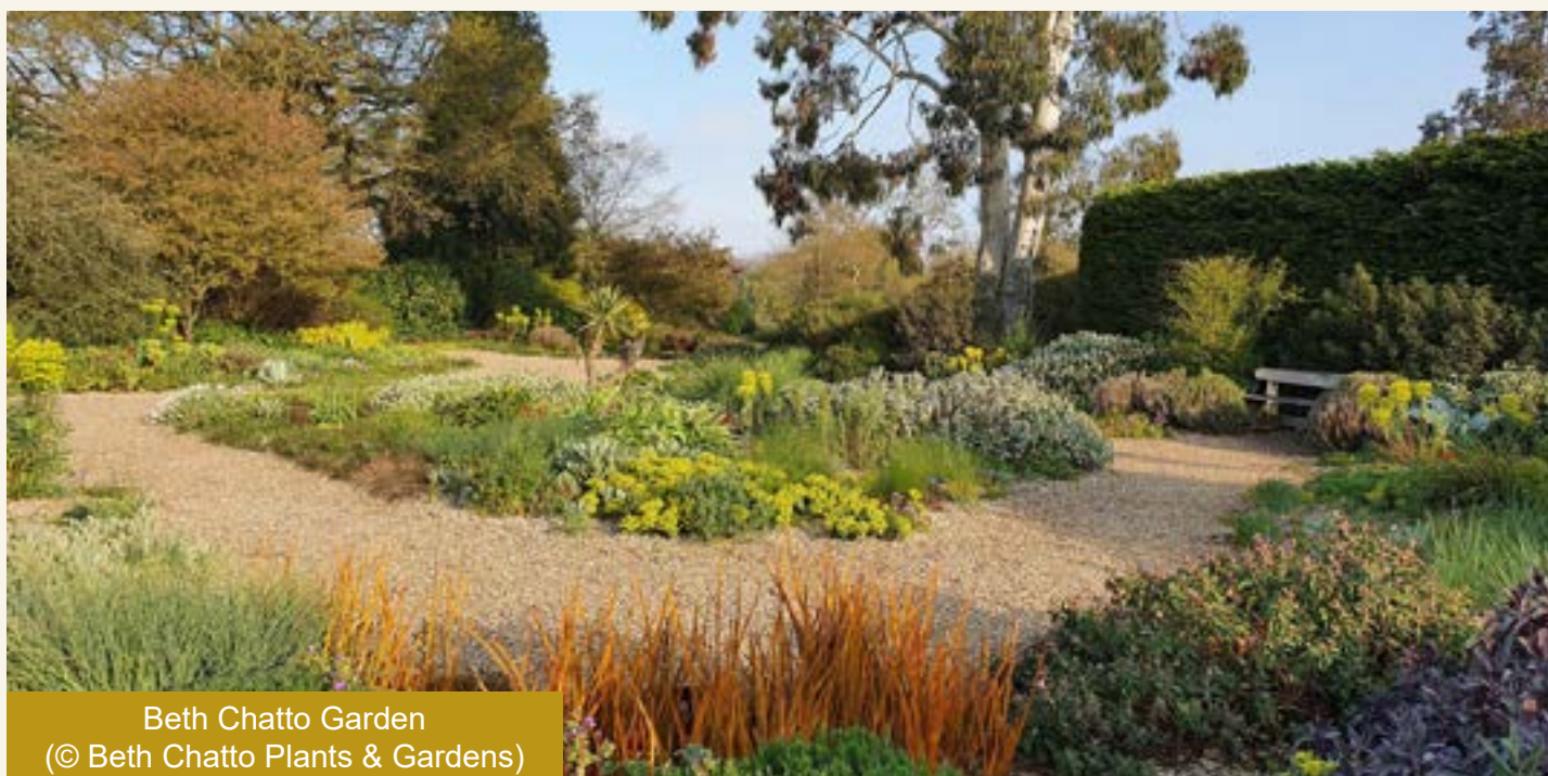
Beth Chatto Garden