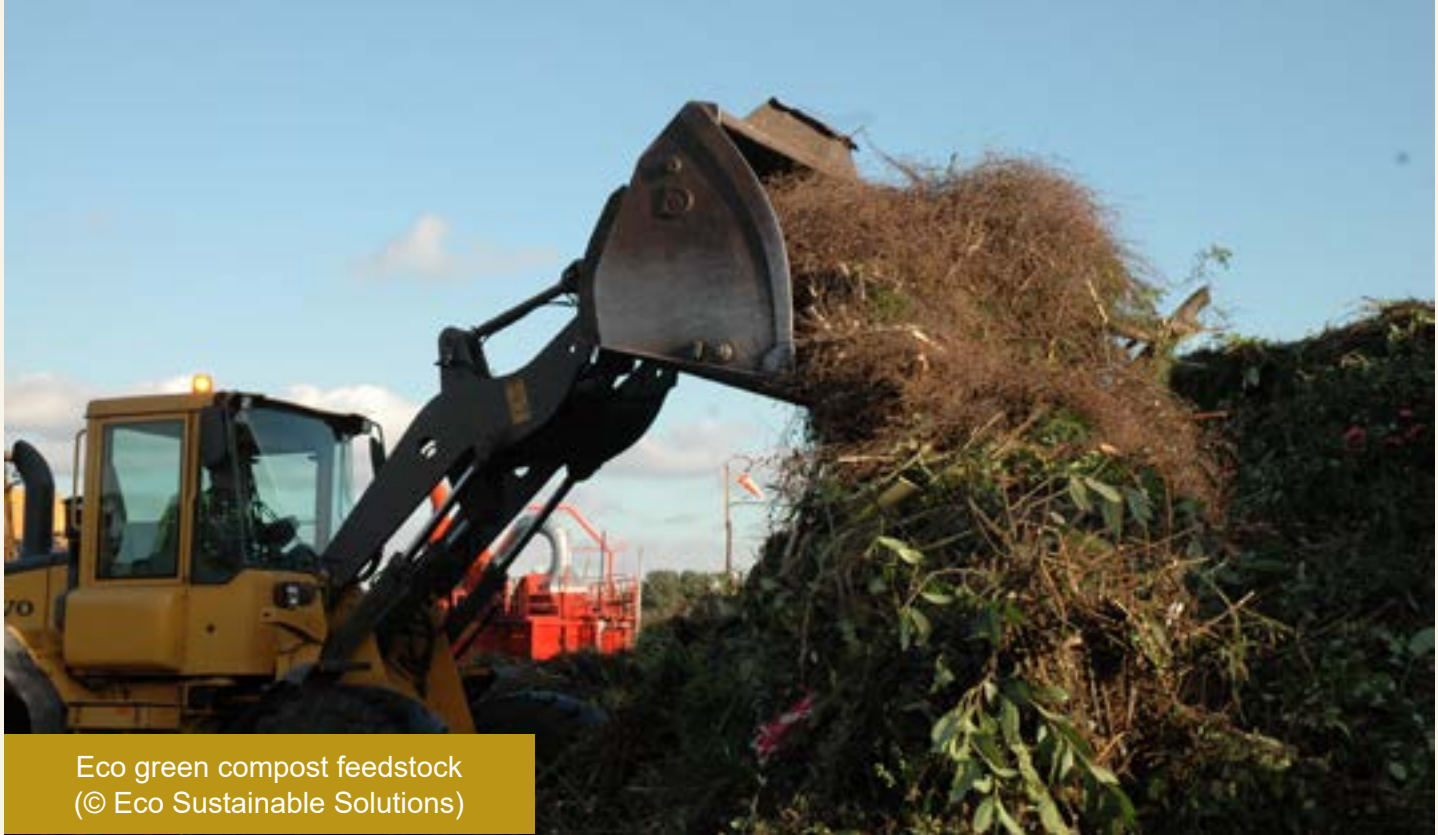
Eco green compost feedstock