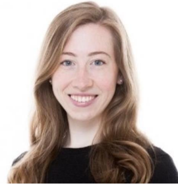
Claire McFadden Scottish government