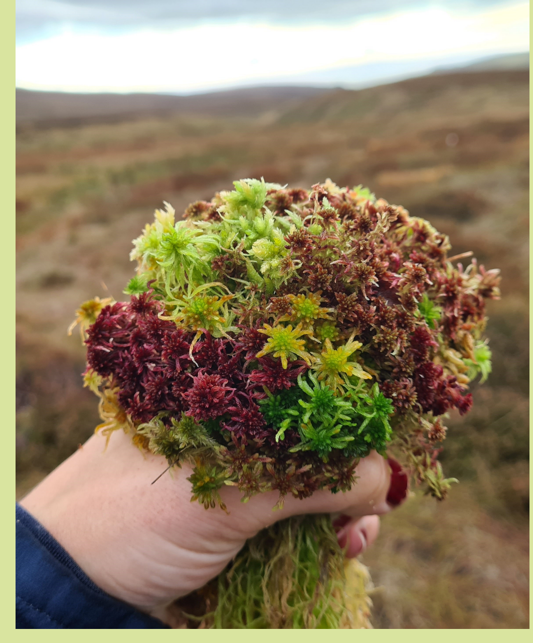
NB: Prior experience using GIS (ideally QGIS) and some basic identification skills for typical bog plants e.g., Sphagnum mosses, cotton sedges etc. is essential