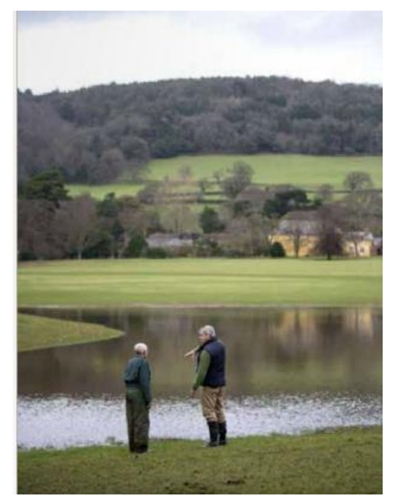
A flood storage area (Somerset project)

<u>Part of a Flood Risk Management (FRM) tool-kit:</u> NFM techniques that are carefully planned and implemented on a catchment by catchment basis are a valuable approach alongside more traditional flood risk management techniques.