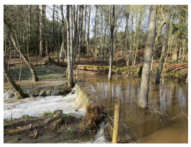
A woody dam (North Yorkshire project)

Extrapolation of the measured local effects of a variety of these techniques has shown that flood peak heights may be reduced by 4% or more on a 9 km<sup>2</sup> catchment scale in the Derbyshire project, by 4% on a 69 km<sup>2</sup> scale in the North Yorkshire project and by 25% on an 18 km<sup>2</sup> scale in the Somerset project. These estimated effects apply to significant sized flood peaks in the order of 1 in 25 annual chance of occurring.