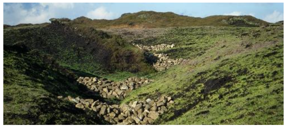
Stone gully blocks and early stage re-vegetation (Derbyshire project)

In catchments where flooding is a major issue for local residents, and where a range of assets are at risk, these projects have shown that it is possible, with due care, to successfully engage with land-holders, win their support in implementing various measures, and also raise community awareness of the relationships between land management and flood risk.