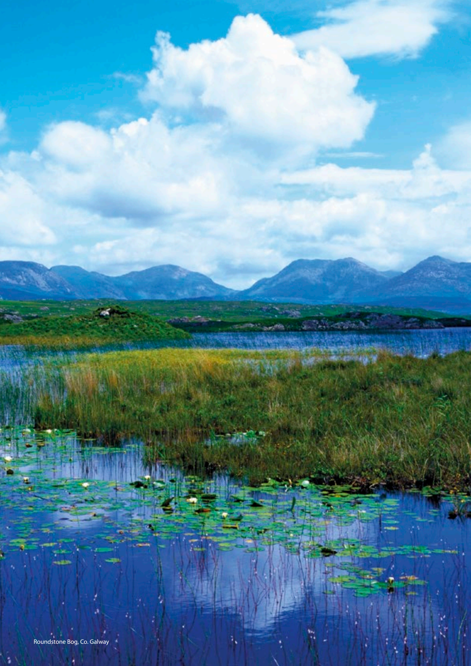
Roundstone Bog, Co. Galway