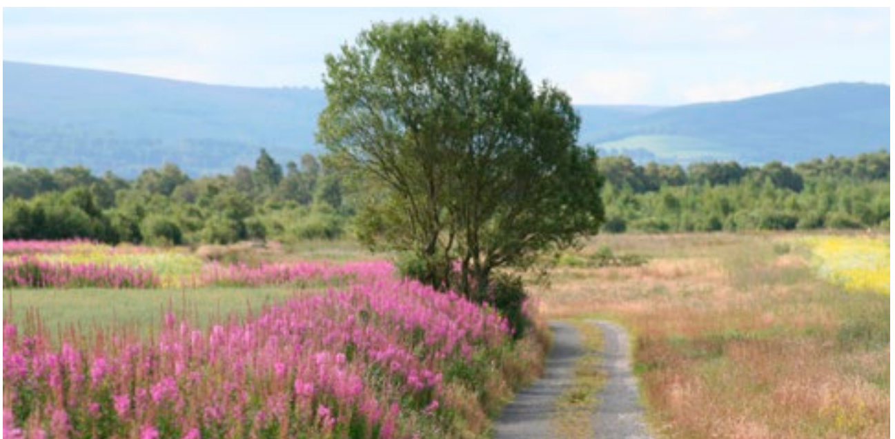
Bord na Móna Restoration Lough-Boora, Co. Offaly