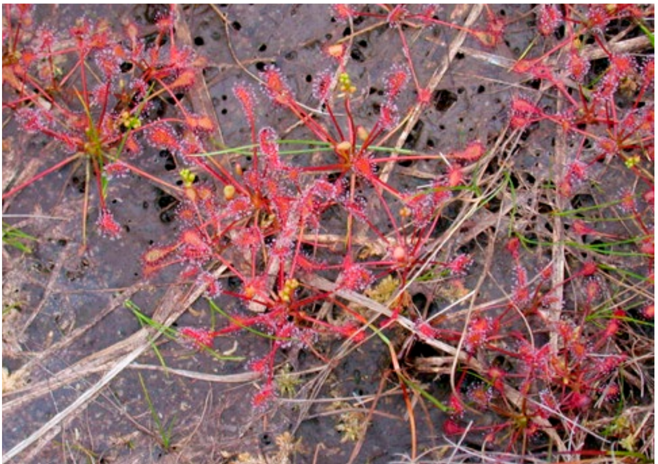
Round Leafed Sundew ( Drosera rotundifolia )