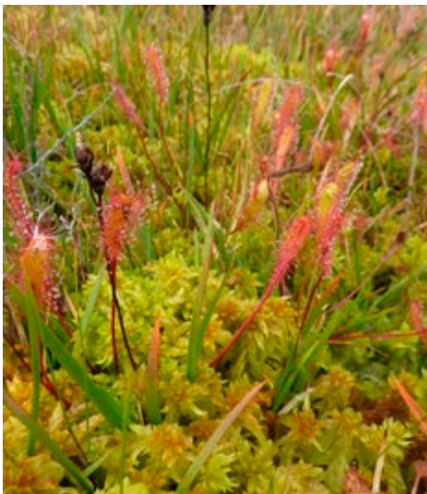
Great Sundew ( Drosera anglica )

Bogs are also home to many rare and protected plants. Typical bog plants include sphagnum mosses, rushes and sedges, bog cotton, ling heather, bog rosemary, bog asphodel and sundew.