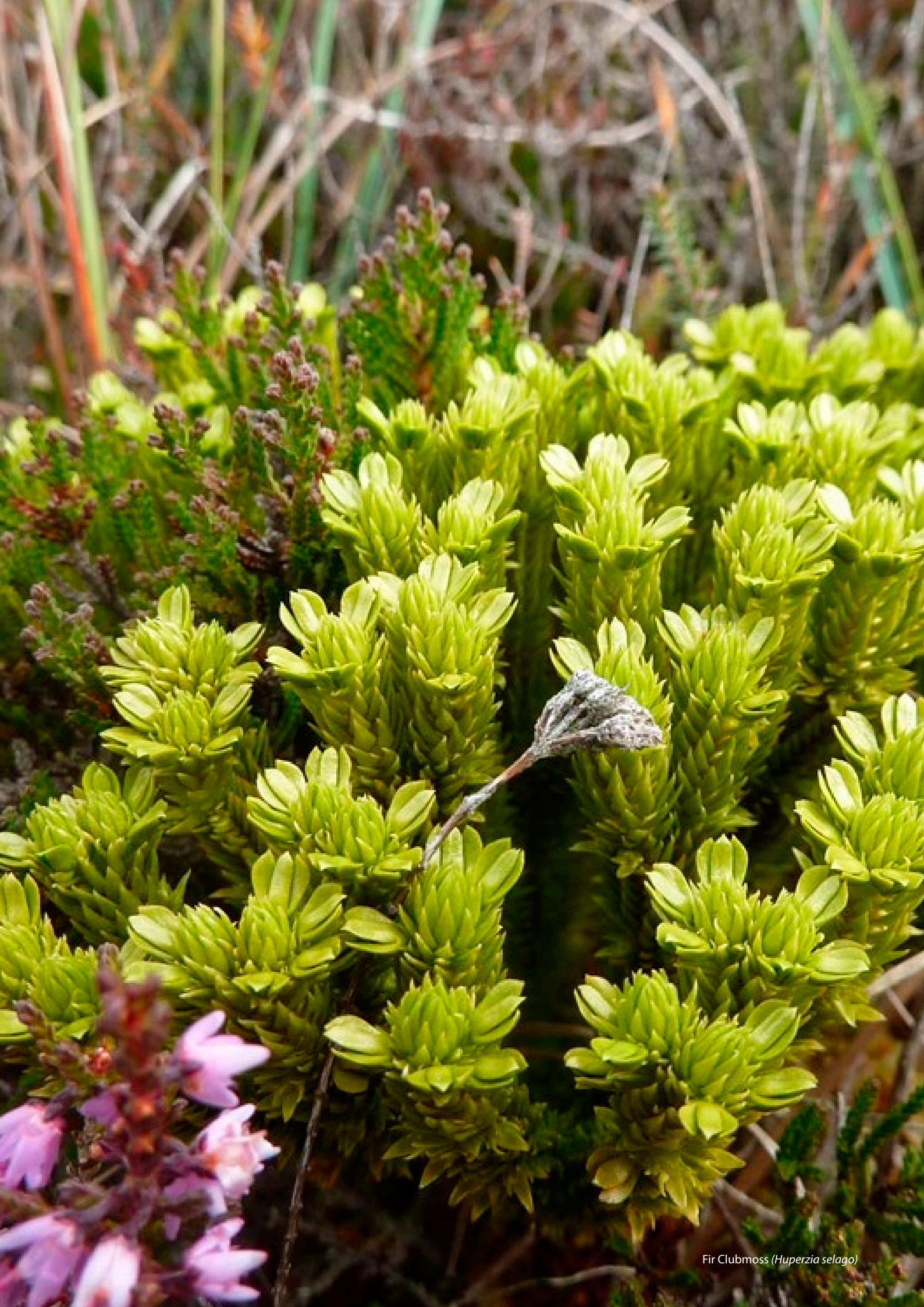
Fir Clubmoss ( Huperzia selago )