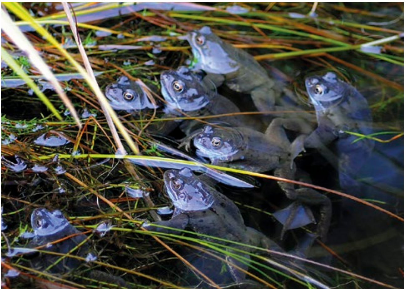
Common frog ( Rana temporaria )

75 raised bog Natural Heritage Areas have been formally designated under the Wildlife Acts. The sites were designated in part response to an infringement action brought against Ireland by the EU Commission relating to the application of the Environmental Impact Assessment Directive to the extraction of peat. The Wildlife Acts provide protection to NHAs through a requirement for certain, potentially damaging activities to require Ministerial consent before being undertaken. Turf-cutting, drainage works and afforestation are typically listed as activities that require such consent. Consequently, in the case of afforestation and tree felling there is a dual consent process, as these activities also require the consent of the Minister for Agriculture, Food and the Marine. The derogation that applied to domestic turf-cutting in raised bog SACs was also applied to NHAs and is still in place. These requirements have not, therefore been generally implemented in regard to turf-cutting. Provision is made for the Minister to allow for damaging activities where imperative reasons of overriding public interest exist.