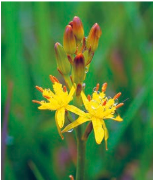
Bog Asphodel ( Narthecium ossifragum )

Peatlands have been in the Irish landscape since the last Ice Age and, together with remnants of primeval forests, they form our oldest surviving ecosystems. Irish peatlands are the country's last great area of wilderness, hovering between land and water, providing unusual habitats for their unique and specialist flora and fauna. They cover a large area of the land surface, occurring as raised bogs, blanket bogs or fens and form distinctive landscapes in many parts of the country.