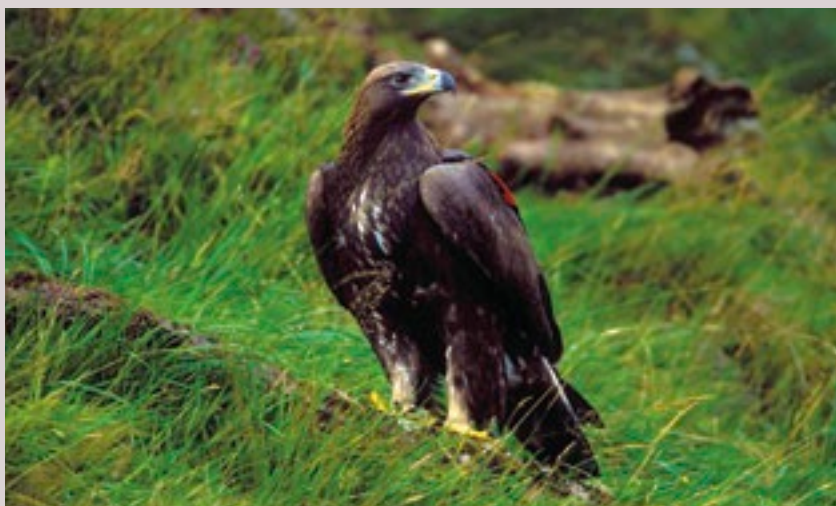
Golden Eagle ( Aquila chrysaetos )

To date, LIFE projects in Ireland have included the reintroduction of the Golden Eagle and two restoration projects for Raised and Blanket Bogs. Further details of all projects are available at http://ec.europa.eu/life .