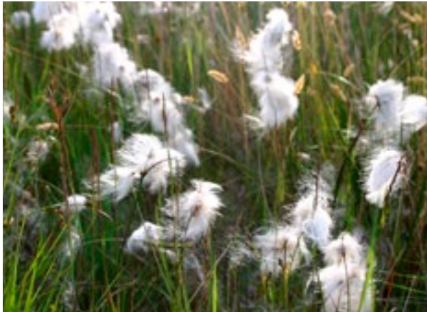
Bog Cotton ( Eriophorum angustifolium )

Legal requirements in relation to peat extraction and the planning process have evolved since the planning system was introduced in October 1964. Developments since 1990 have been extensive but some of the main changes are summarised below.