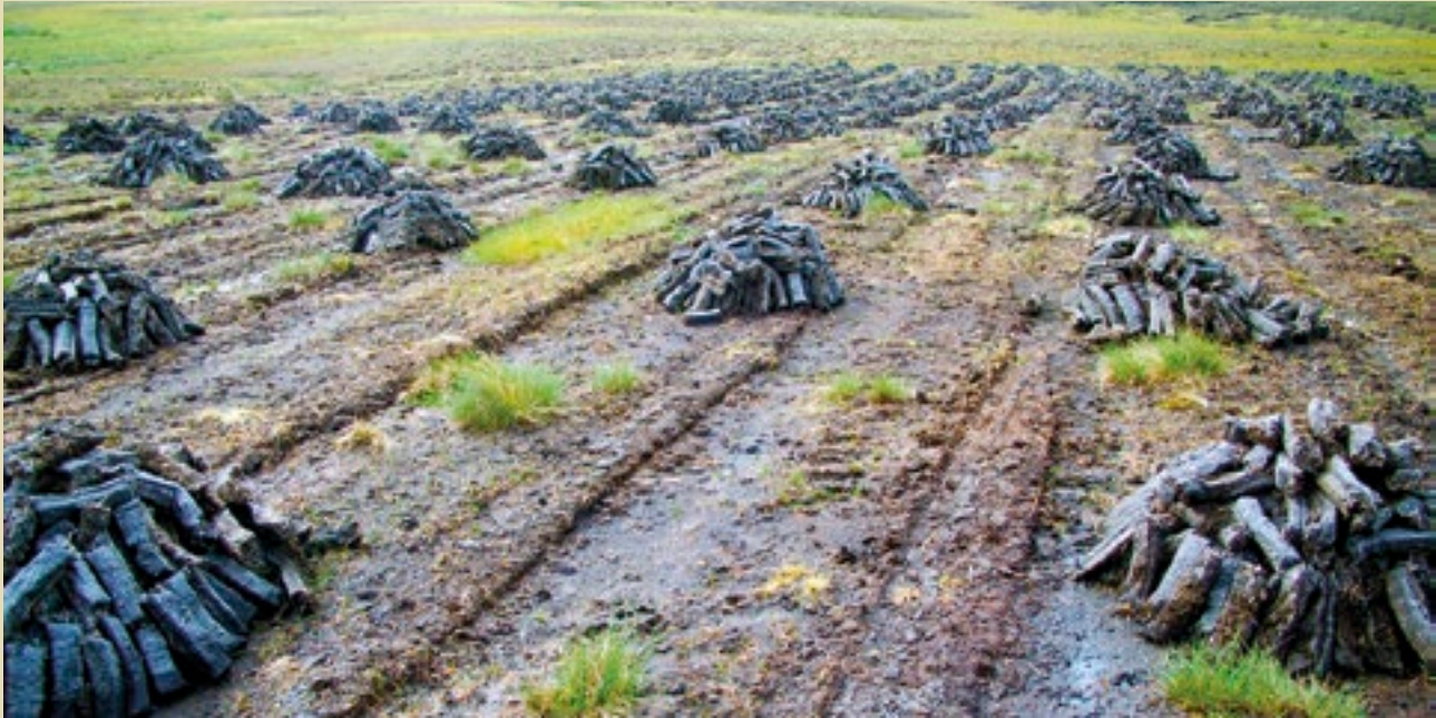
Turf cutting, Sheeffry Hills, Co. Mayo

Peatlands are wetland ecosystems that are characterised by the accumulation of organic matter called peat which derives from dead and slowly decaying plant material under wet conditions. Irish peatlands are principally bogs with a small proportion of fens. Both bogs and fens appear in natural condition but the majority have been modified by man.