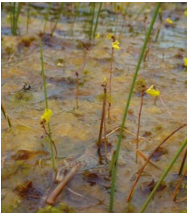
Lesser Bladderwort ( Utricularia minor )

Three important international documents dealing with the wise use of peatlands have made specific recommendations on education and training. These are the Joint International Mire Conservation Group and International Peat Society Wise Use guidelines for Global Mires and Peatlands , The International Peat Society Responsible Peatland Management Strategy and the Ramsar Global Action Plan for Peatlands . These documents point to the need to develop and implement mainstream environmental education and training programmes focusing on peatlands. They stress that such programmes should involve not only imparting knowledge and information, but must seek to modify behaviour and develop lifestyles that are harmonious with the wise use of peatlands. This implies that they must be life long and aimed at all sectors of society - citizens, communities, business and industry. At national level the Irish Peatland Conservation Plan 2020, prepared by the Irish Peatland Conservation Council makes a number of strategic recommendations for Government on environmental education.