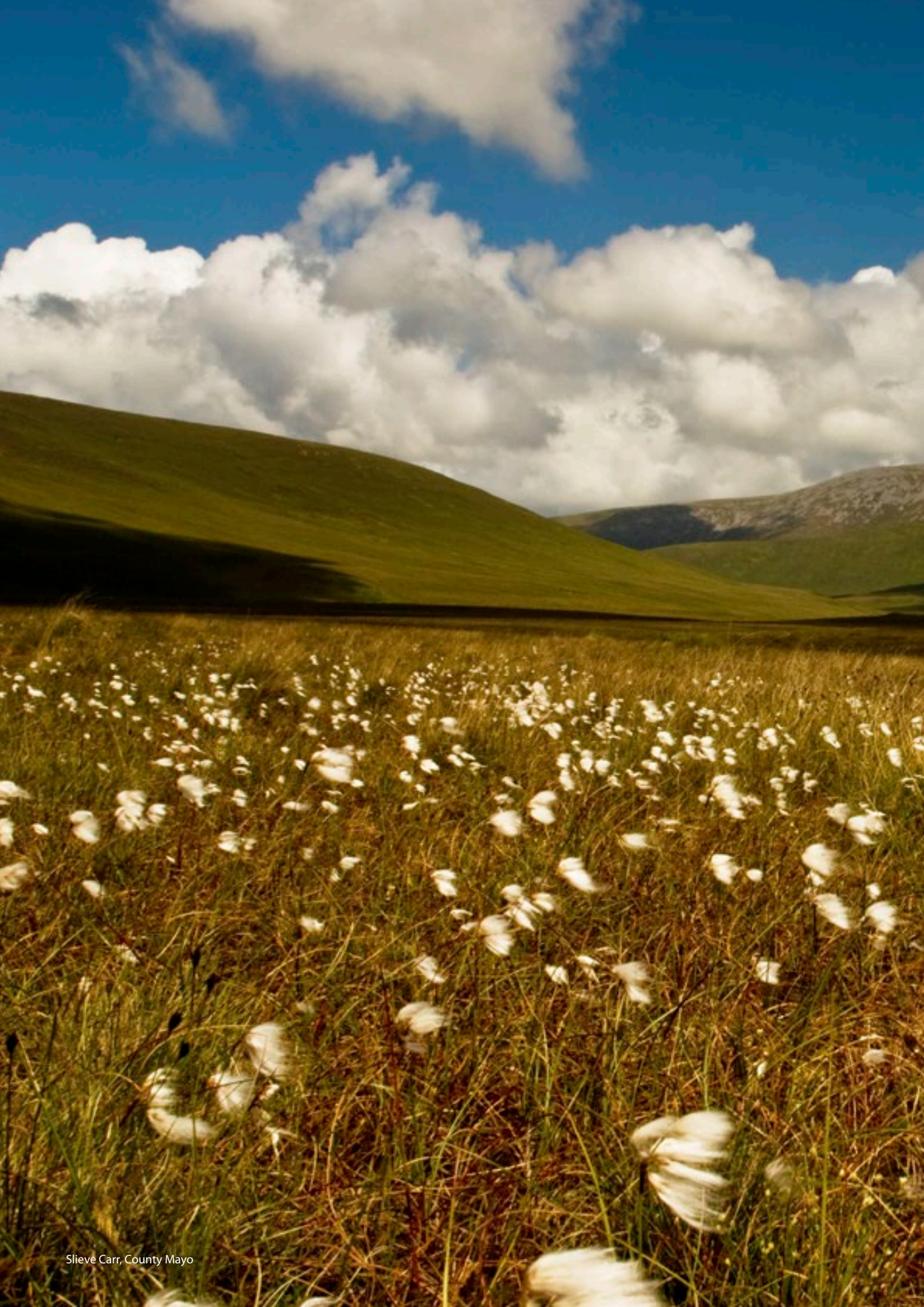
Slieve Carr, County Mayo