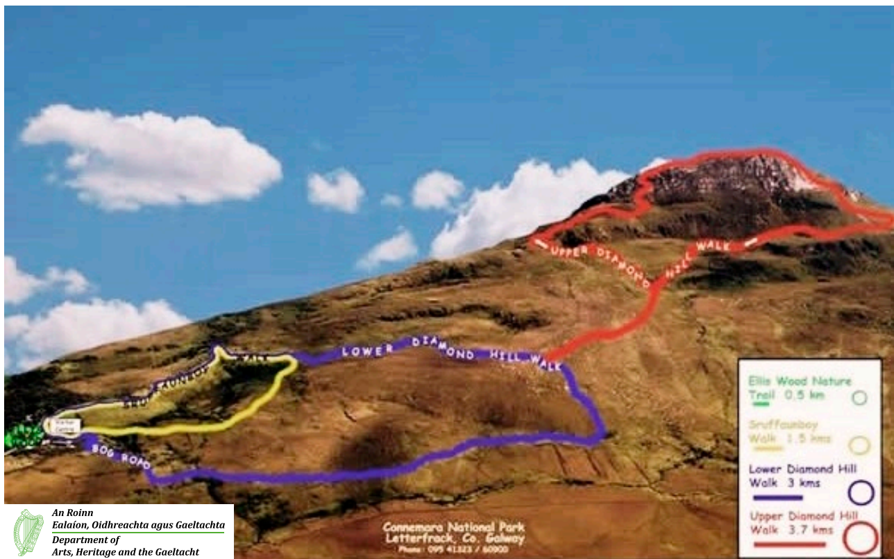
Diamond Hill Walking Trails, Connemara National Park