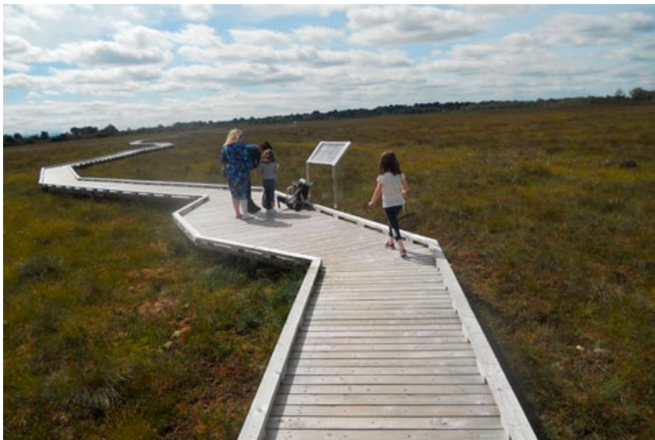
Clara Bog Boardwalk, Co. Offaly.

Relevant public authorities will review their activities and approaches in regard to education and public awareness of the value and uses of peatlands and will outline the outcome of their review to the Peatlands Strategy Implementation Group. The Peatlands Group, in consultation with the Peatlands Council will assess current activities, including those of NGOs, and make recommendations to Government regarding further measures that may be required to inform the public of the economic, social and environmental benefits of responsible peatlands management. The recommendations of the Bogland Report will be considered by the Peatlands Group in this context.