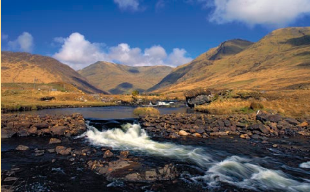
Delphi Valley, Co. Mayo.

Peatlands have been used for afforestation, domestic and industrial turf-extraction, grazing and agricultural reclamation and have been used for various types of infrastructural development. Ireland's peatlands can continue to host such activities into the future. In the 20th century large-scale peat production on raised and blanket bogs was undertaken by Bord na Móna, which was established by the State for that purpose and which is now focused mainly on the drained, raised bogs of the Irish midlands. These activities continue to contribute significantly to economic development by supporting employment both directly and indirectly as well as providing a secure source of indigenous energy. Many Irish peatlands were also drained and reclaimed for agricultural use and forestry. More recently, there has been a growing awareness and appreciation amongst policy makers and the general public of the other values of functioning bogs and the benefits that they provide.