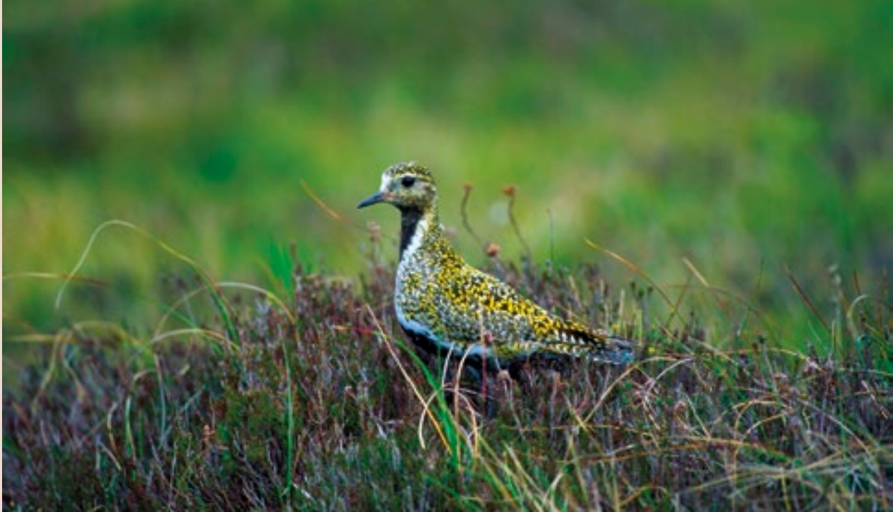
Golden Plover ( Pluvialis apricaria )

The development of an overall National Peatlands Strategy arises from the need to take a broad strategic approach to the future management of Ireland's peatlands. Policy gaps and weaknesses in relation to the regulation of activity on Ireland's considerable peatlands (over 20% of the terrestrial area of the State) have resulted in difficulties in meeting EU legal obligations.