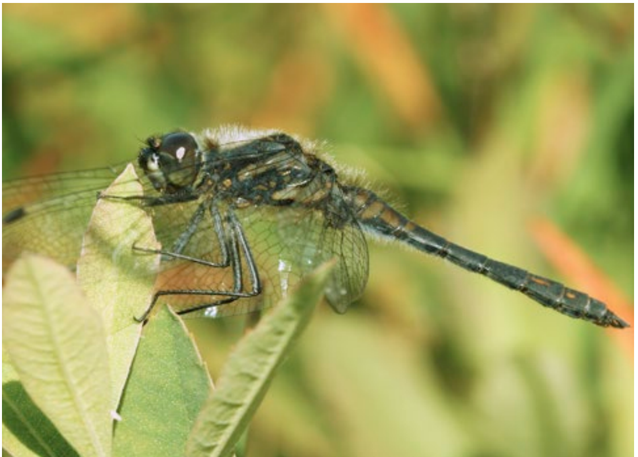
Black Darter ( Sympetrum danae )

A way forward is provided for as part of this Strategy. In January 2014, the draft National Raised Bog SAC Management Plan was published along with a comprehensive review of raised bog Natural Heritage Areas (NHAs) and undesignated raised bogs which has informed a radical reconfiguration of our network of NHAs. This will provide for significantly improved conservation outcomes while avoiding areas that are subject to significant turfcutting and will markedly reduce costs for the taxpayer. A number of Bord na Móna owned bogs which have been subject to focused conservation and restoration effort by the Company, will be included in the NHA network. Other sites of conservation value where there is little or no turfcutting pressure will also be included. It is anticipated that many sites that are currently raised bog Natural Heritage Areas will be de-designated as part of this process. This will also assist in underpinning protection of raised bog SACs.