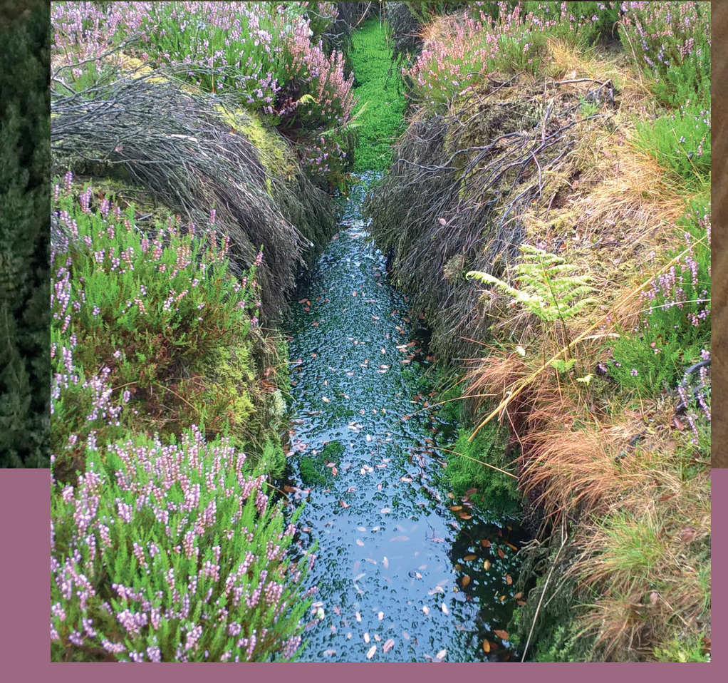
Blocking ditches using peat and timber dams