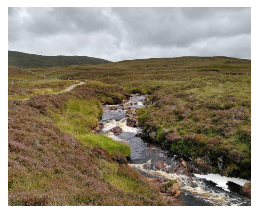
The quality of water flowing from peaty catchments not only supports the functioning of other ecosystems downstream but also impacts the security and cost of drinking water to much of the UK's population.

The impact of floating roads on hydrology has been observed from satellites using InSAR radar which recorded around floating roads in Scotland a lowering in peatland surface height (as water tables decreased) on the downslope adjacent to the roads<sup>21</sup>.