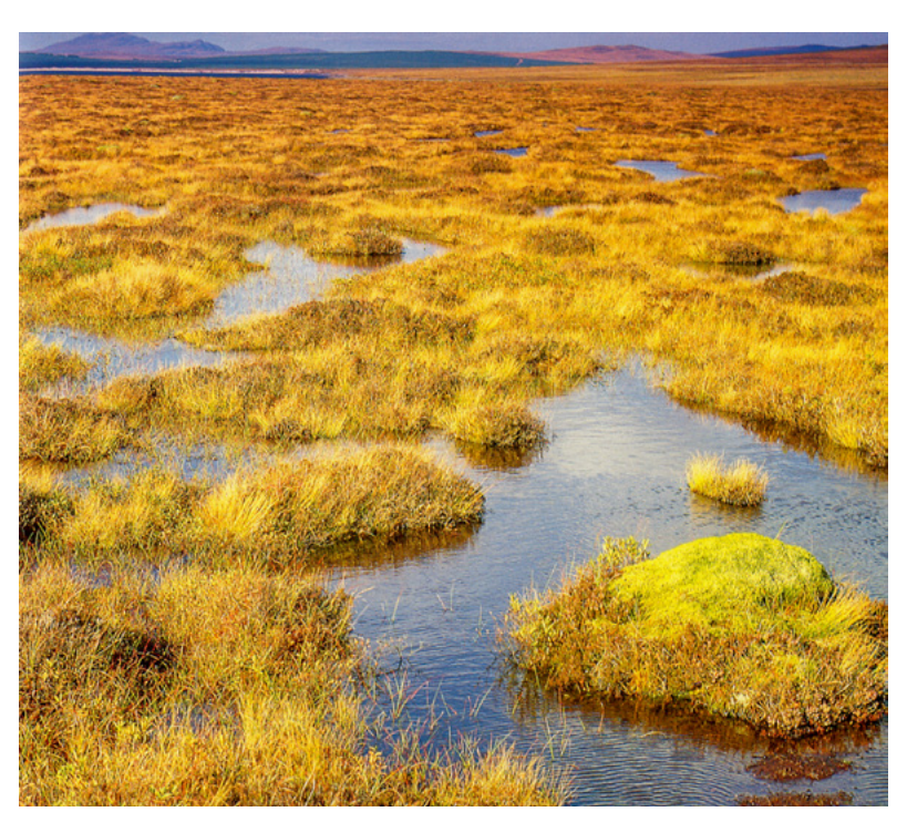
The open landscape of blanket bogs such as the Badnaloch Bogs SSSI in the highlands are important to the species that inhabit them.