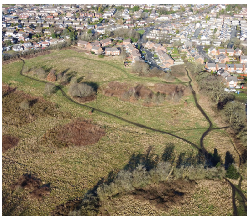
Danes Moss is a SSSI lowland raised bog in Cheshire England, bordered by agricultural land and housing and business development. Currently, planning is being sought to extend development onto 55 ha of the site.

This monitoring should be undertaken by individuals with a competent knowledge of the complexities of peatland ecology and function. These 'Peatland Protection Officers' could be part of the local authority or of a third-party organisation funded by all industries that seek to develop on peatlands to avoid further stretching the existing limited local authority resources. Either way, they could advise planners, oversee active monitoring of developments that have been approved, gather the data needed for compliance cases and raise reports of non-compliance within the local authority.