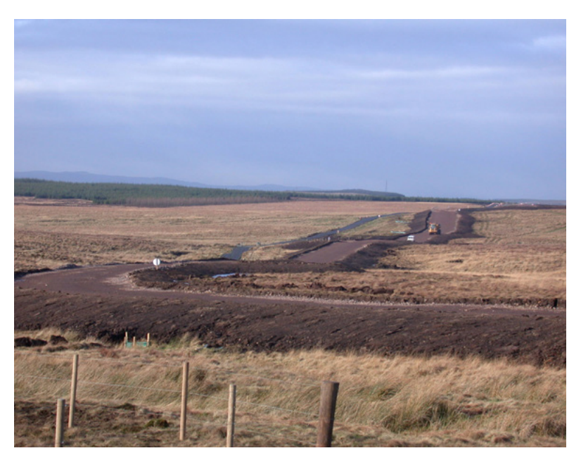
Roads and tracks constructed across peatlands can result in the excavation of peat but also lead to a severe impairment of the hydrological functioning of the landscape.