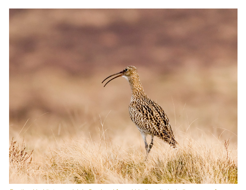
Peatland habitats are rich in floral and faunal biodiversity including some of our most valued and threatened species of waders such as the Eurasian curlew, Numenius arquata, which has seen a steep decline in the last 30 years.

All the above typically include building works and/or groundworks. Developments that are inappropriately located, designed and managed can have an adverse impact on peatland biodiversity and ecosystem function.