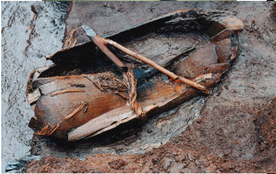
The Archaeological Record of Peatlands...