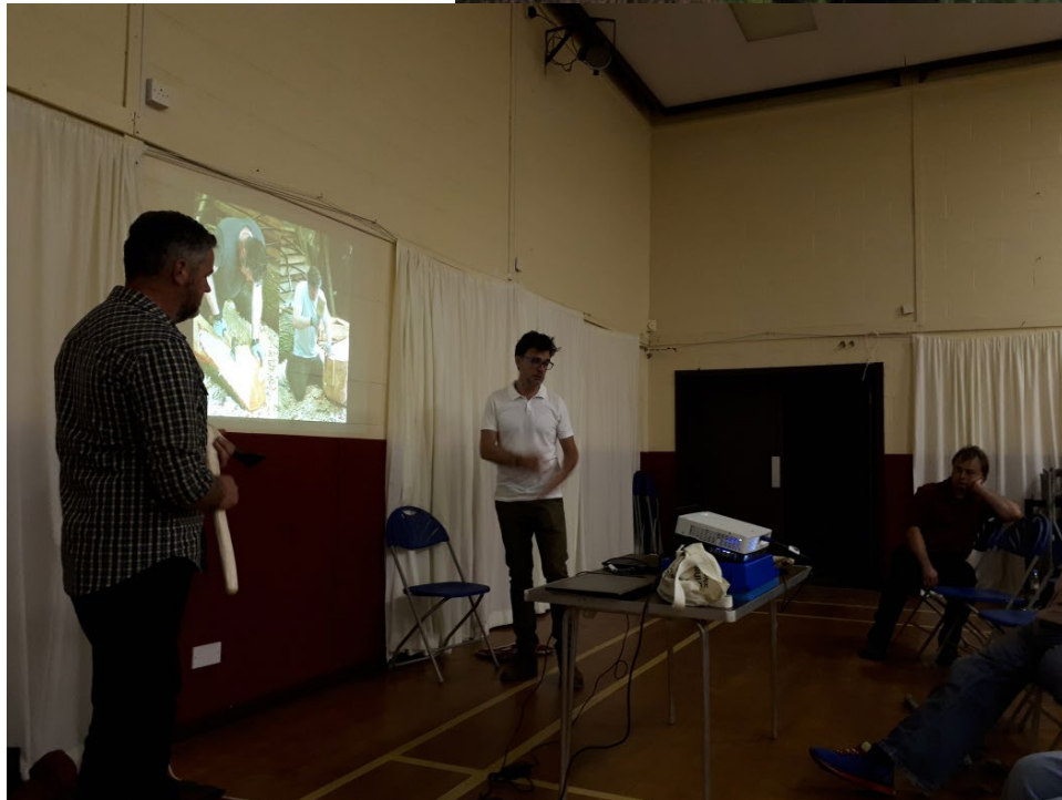
The recrafted Goddess on Ballachulish Moss...